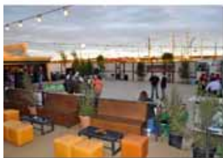
Beer Garden/ Patio